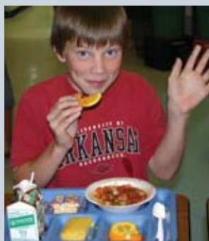
Bismarck elementary school student enjoys homemade vegetable soup, cornbread, fresh orange slices and low-fat chocolate milk.

Not only has Ms. Hill helped students develop healthier eating habits, she finished each year with a profit, proving that nutritious meals don't have to be more expensive than less wholesome ones.