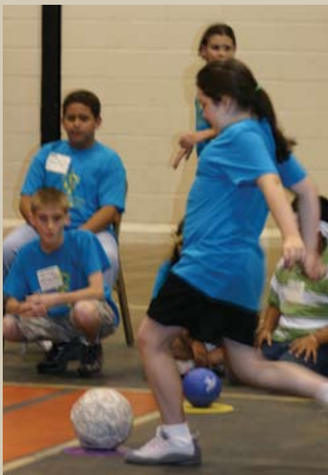
Students in grades 1–5 participated in the Eagle Mountain Games and everyone took home a medal.

Parents are informed of their child's fitness level through reports sent home at the beginning and end of each year. Reports include BMI measurement and health-related fitness scores for the sit and reach test, partial curl-ups, push-ups and fitness and shuttle running.